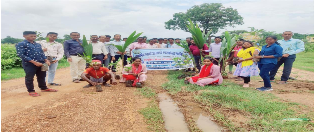
Figure 1: Plantation activity

Addressing social issues such as environment through eco club: To involve participation of students in various environment related activities such as tree plantation, carrying out tree census, and immediate neighborhoods. Eco clubs can also participate in activities to celebrate important environmental days such as World Environment Day.