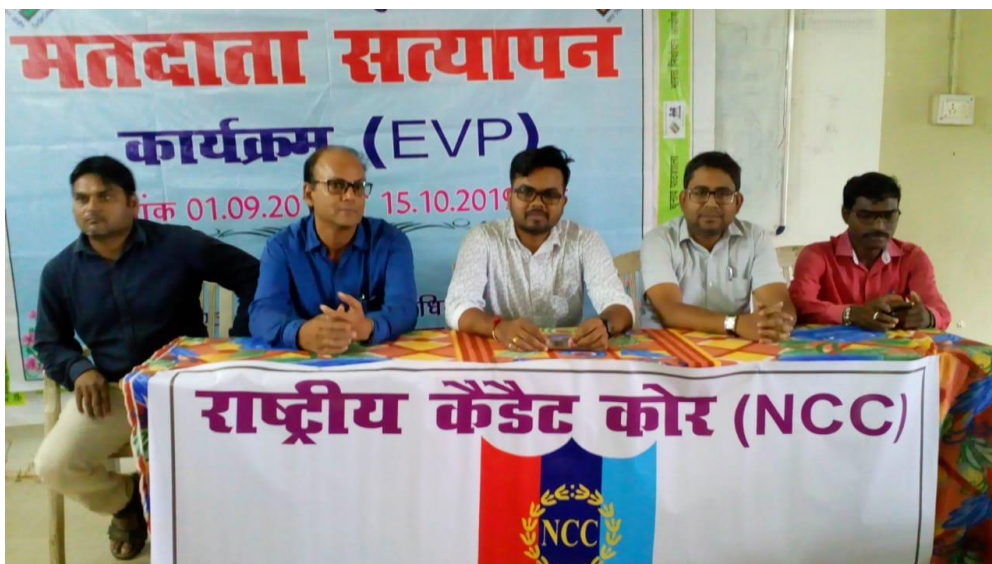
Figure 6. EVP Awareness Campaign through NCC.