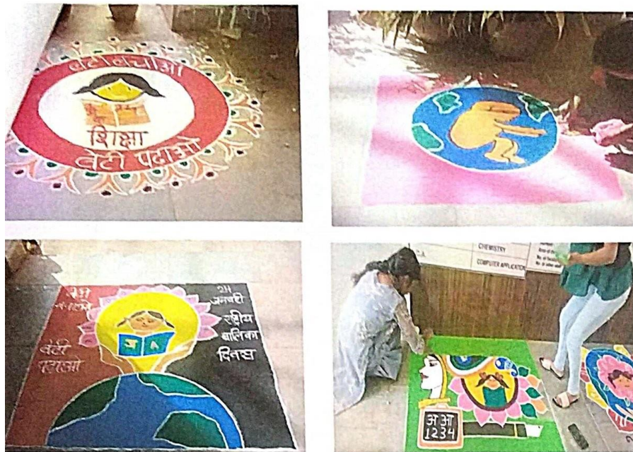
Figure 10. National Girls Day through Arts Departments.