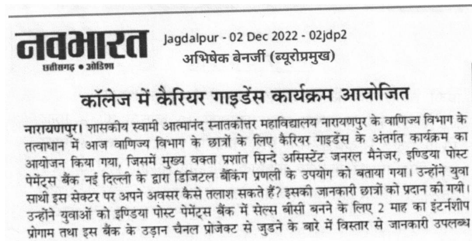
Figure 11. Carrier Guidance Program through Commerce Department.