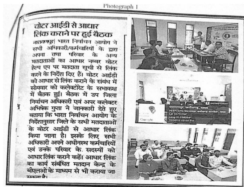
Figure 12. Voter id link with Aadhaar Card Campaign through SVEEP