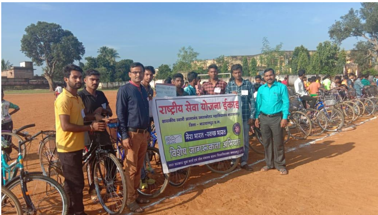
Figure 2. Cycle Rally to protect environment