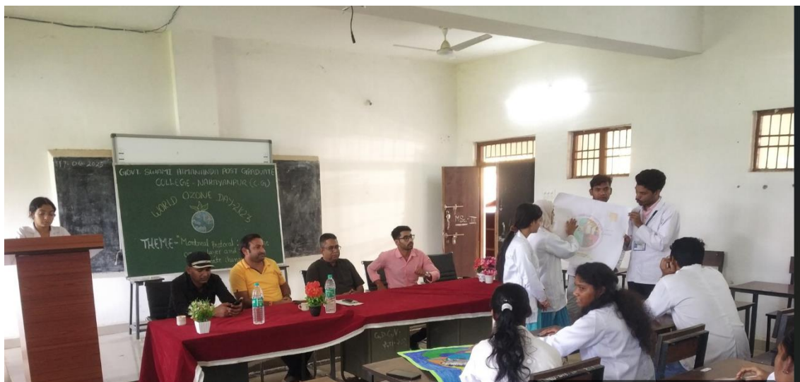
Figure 7. Climate changes and prevention of Ozone depletion through science department.

Addressing social issues through Science Department: The Science departments address assorted social issues through a variety of activities in our college such as mental issues, irrational use of natural resources, health, human behaviour, food additives and climate changes. Some of the activities are shown here: