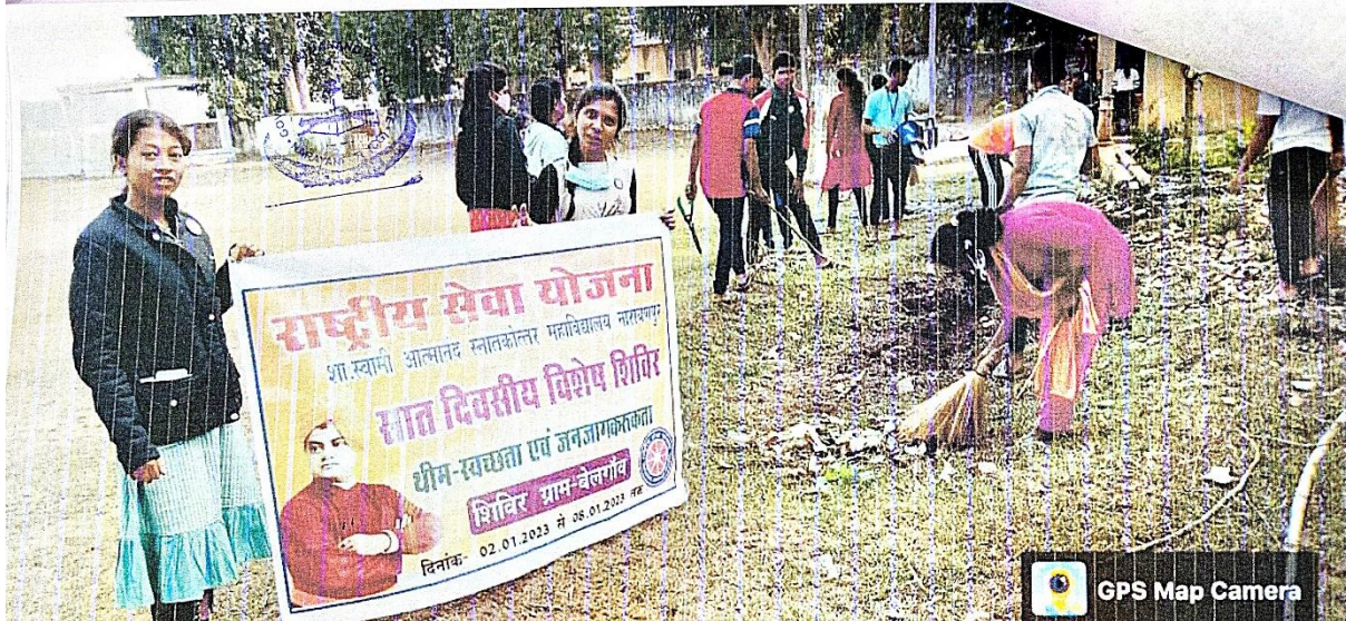
Figure 3. Cleanliness in street crossings.

Addressing social issues through NSS: The National Service Scheme (NSS) addresses assorted social issues through a variety of activities, including Special camp in the villages, Awareness campaigns, Skill development program, Community service, Dissemination of information and Discussions on social evils. Some of the activities shown here which have been performed by NSS students of our college.