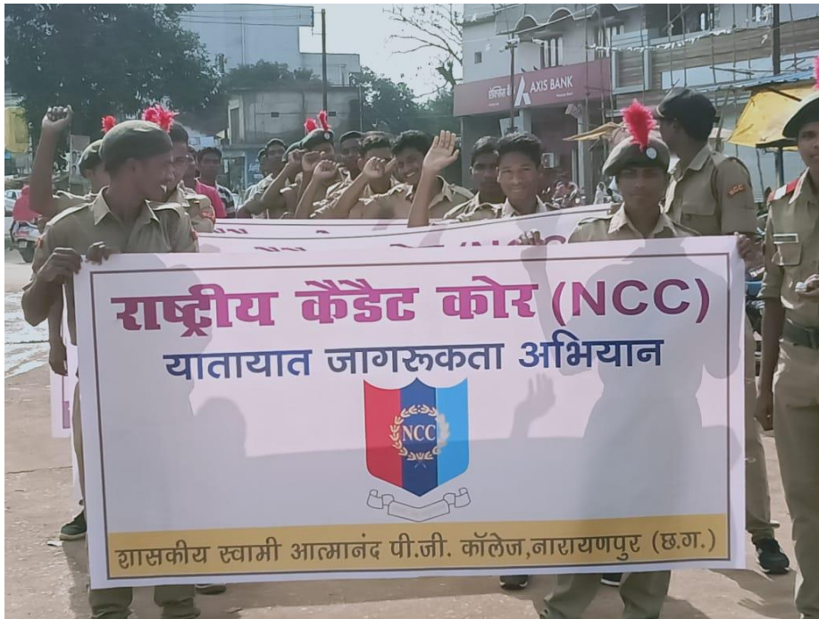
Figure 5. Traffic Awareness Campaign through NCC.

NCC is also contributed in the field of social services. NCC is one who popularising yoga, cleanliness and digital awareness in the country. NCC is spreading awareness in the field of environment, health and election process take proactive action, rallies, awareness, street play etc. These activities encourage cadets to participate voluntary work within their communities and neighbourhood.