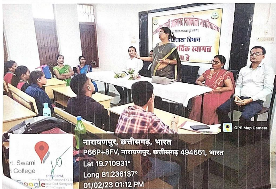
Figure 9. Tribal Culture through Arts Departments.